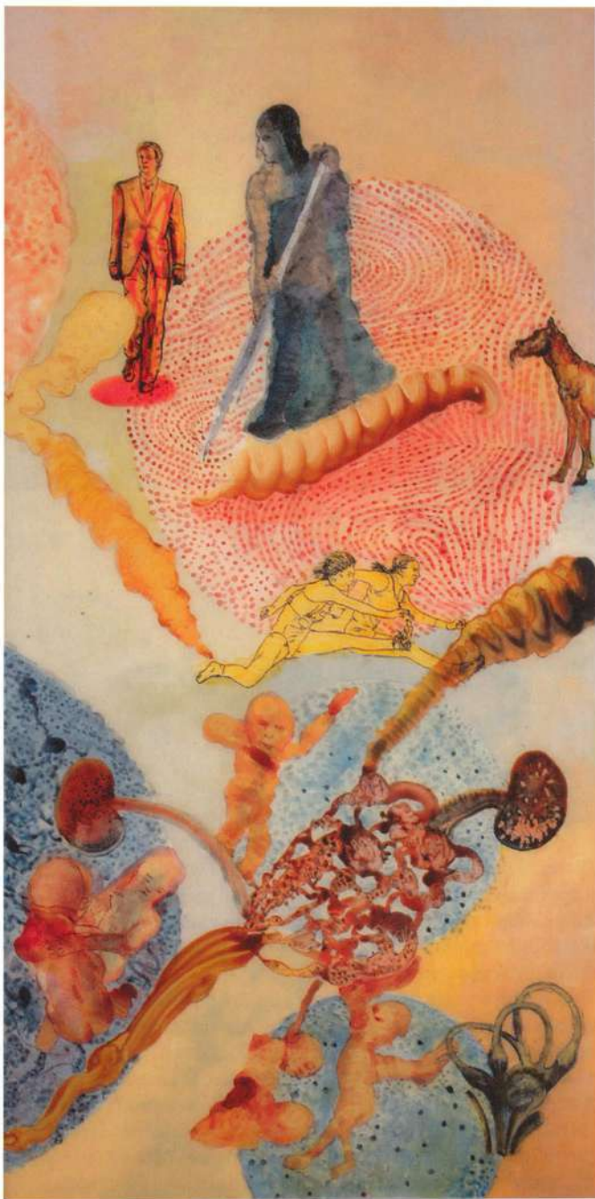
(This page) SPLITTING THE OTHER (PANEL 9) , 2007, acrylic, ink, enamel on acrylic sheet, 203.5 x 103.5 cm.